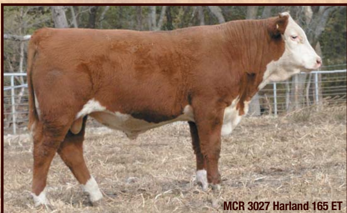
MCR 3027 Harland 165 ET