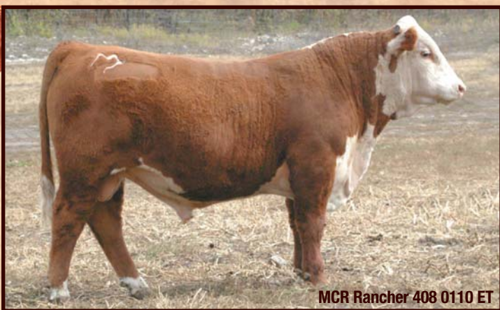
MCR Rancher 408 0110 ET

Change for the sake of change isn't always good. Measured, managed change to take advantage of new paradigms is necessary to sustain every good business. Production costs, weather and the economy are all signals that require beef producers to continually rethink marketing strategies and make change. Heterosis is a natural occurring risk management strategy and it's free. Change is good. Change in your pocket is better! We hope you will join us February 28, 2012, Manhattan, KS for the Mill Creek Ranch the "Brand That Works" Production Sale.