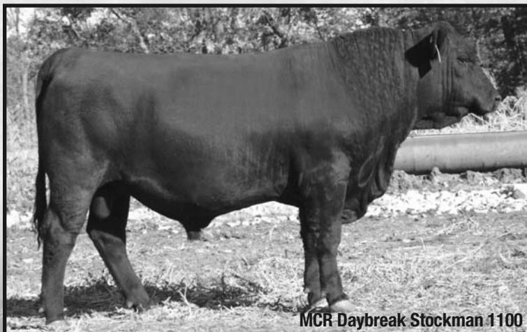
MCR Daybreak Stockman 1100