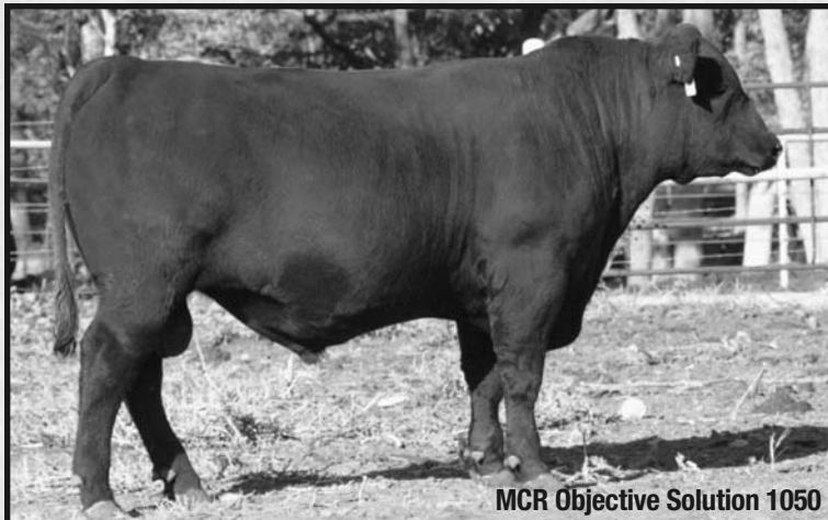
MCR Objective Solution 1050

Change for the sake of change isn't always good. Measured, managed change is necessary to sustain every good business. Production costs, weather and the economy are all signals that require beef producers to continually rethink marketing strategies and make change. Heterosis is a natural occurring risk management strategy and it's free. Change is good. Change in your pocket is better! We hope you will join us February 28, 2012, Manhattan, KS for the Mill Creek Ranch the "Brand That Works" Production Sale.